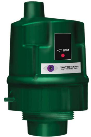
WATCHMAN SENSOR DEVICE

You'll receive regular updates about tank levels and usage across your business, we can update you daily or weekly and in a range of formats - from smartphone to text alerts. The choice is yours.