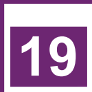
PROJECTED RUN OUT DATE