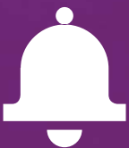
SUDDEN DROP ALERT